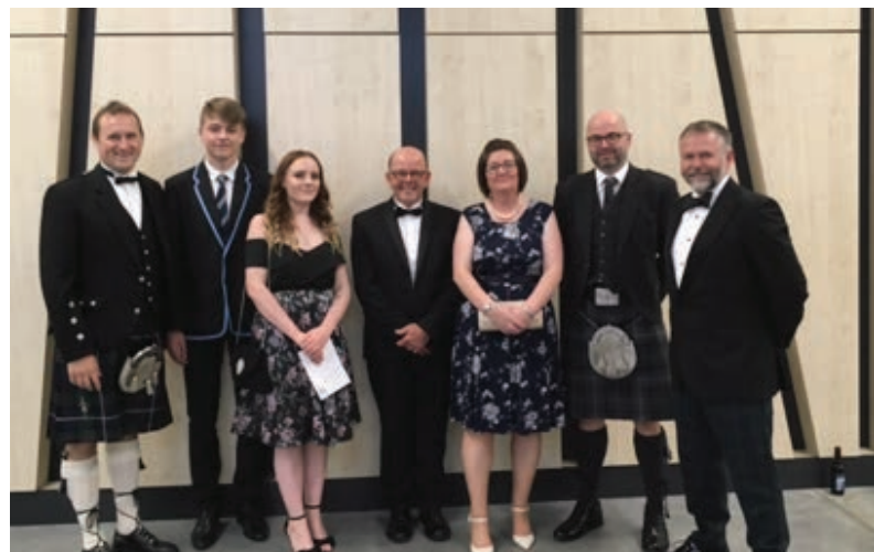
Representatives from Score Group plc and Mintlaw Academy at the awards