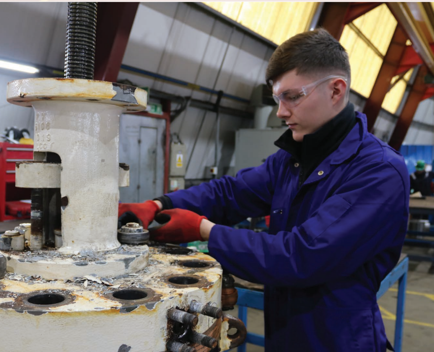
Work experience student getting hand on in Score Europe's Control Valve Department in Peterhead