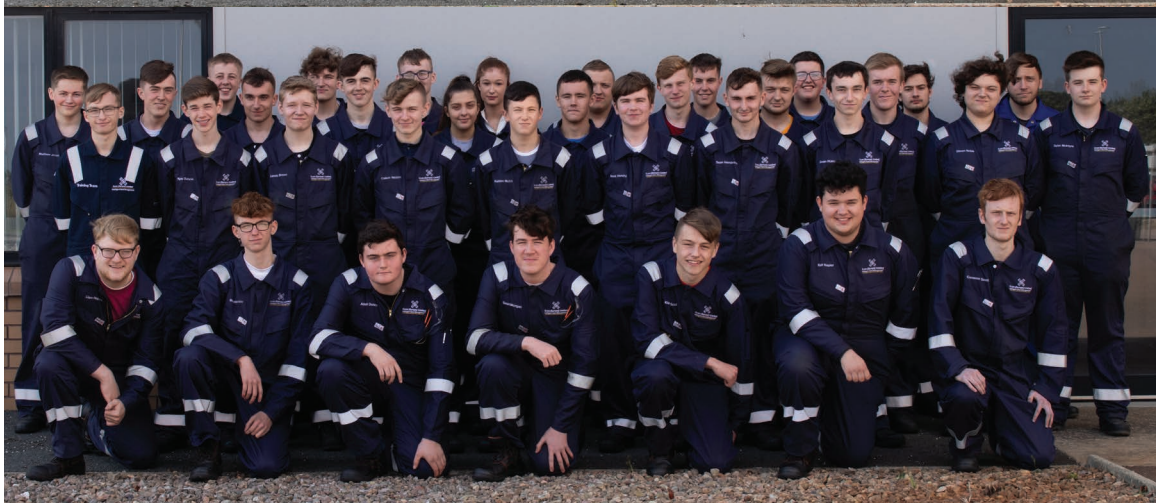
Summer intake of 2019 engineering apprentices