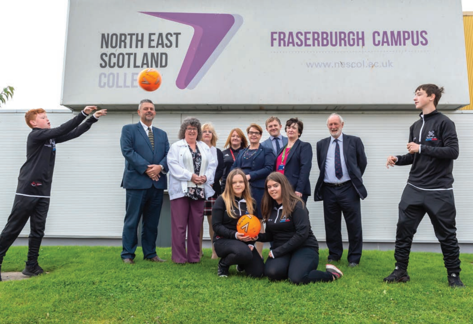
Representatives of supporting organisations at the FraserDeen launch event