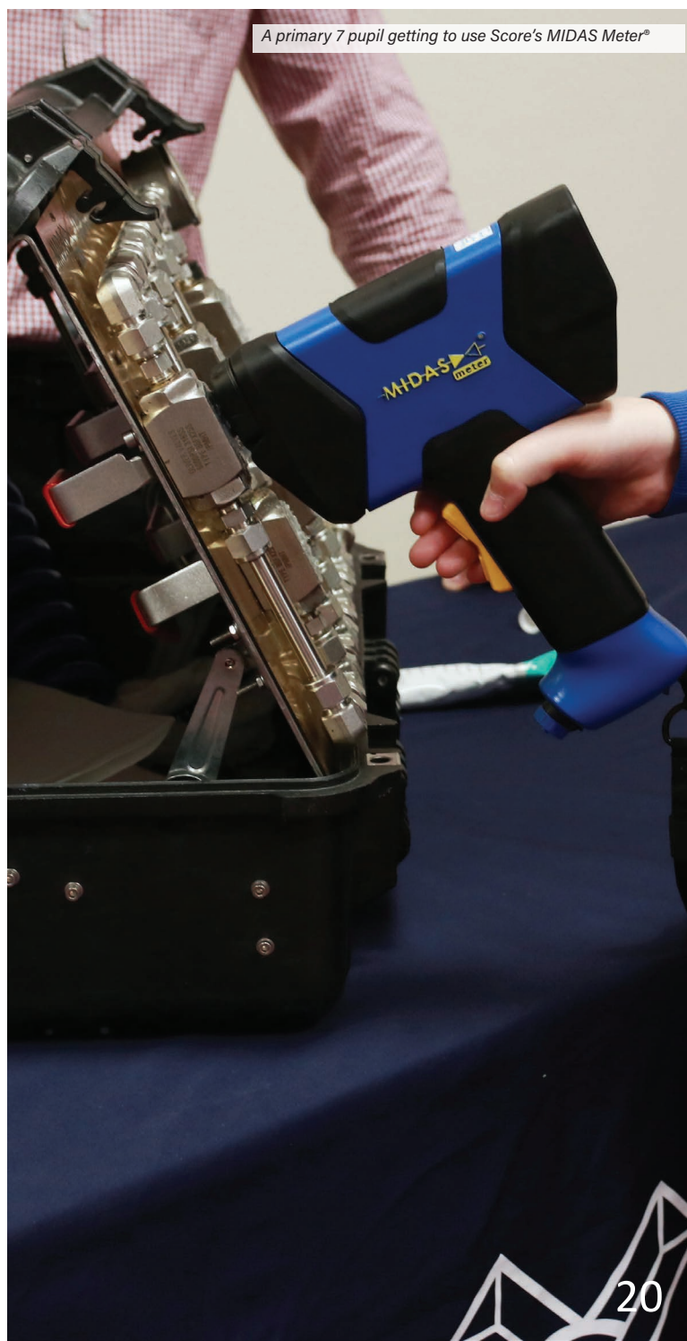
A primary 7 pupil getting to use Score's MIDAS Meter®

"We hope to see them enter our award winning Modern Apprenticeship programme over the coming years!"