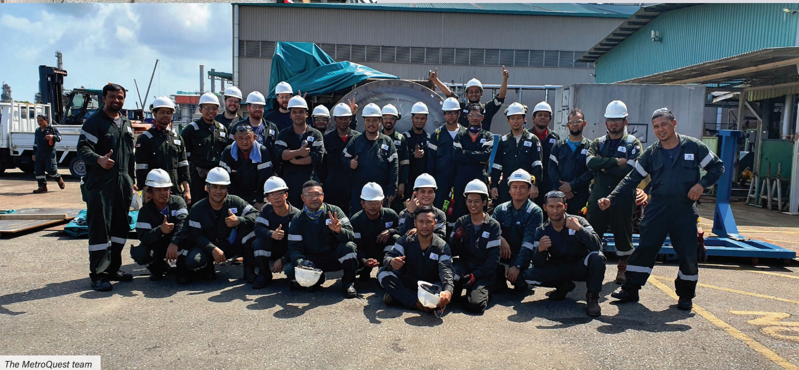
The MetroQuest team

This fully equipped container will be used to provide offshore testing, maintenance and repair services at our clients' locations.