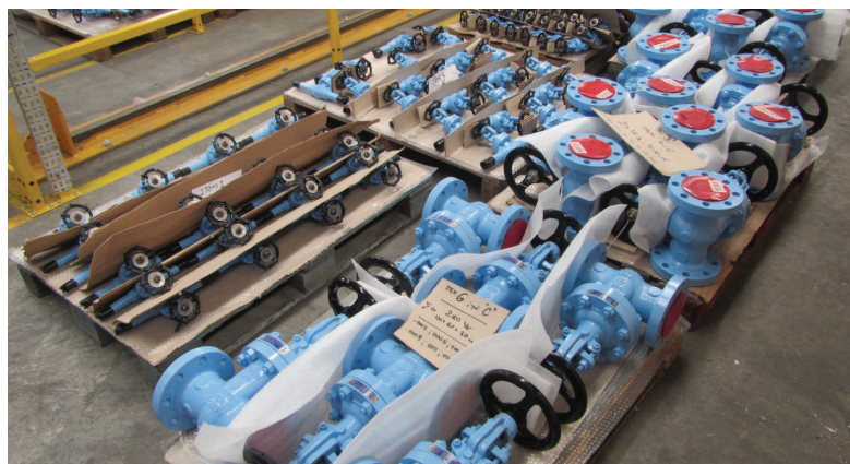
Valves ready to send to the client

These lovely "purple light blue" valves will be remembered. Thank you very much for the accurate and competent work done by production team in Italy and thanks to the Italian sales project team for their hard work in planning and organising the huge amount of information and prices.