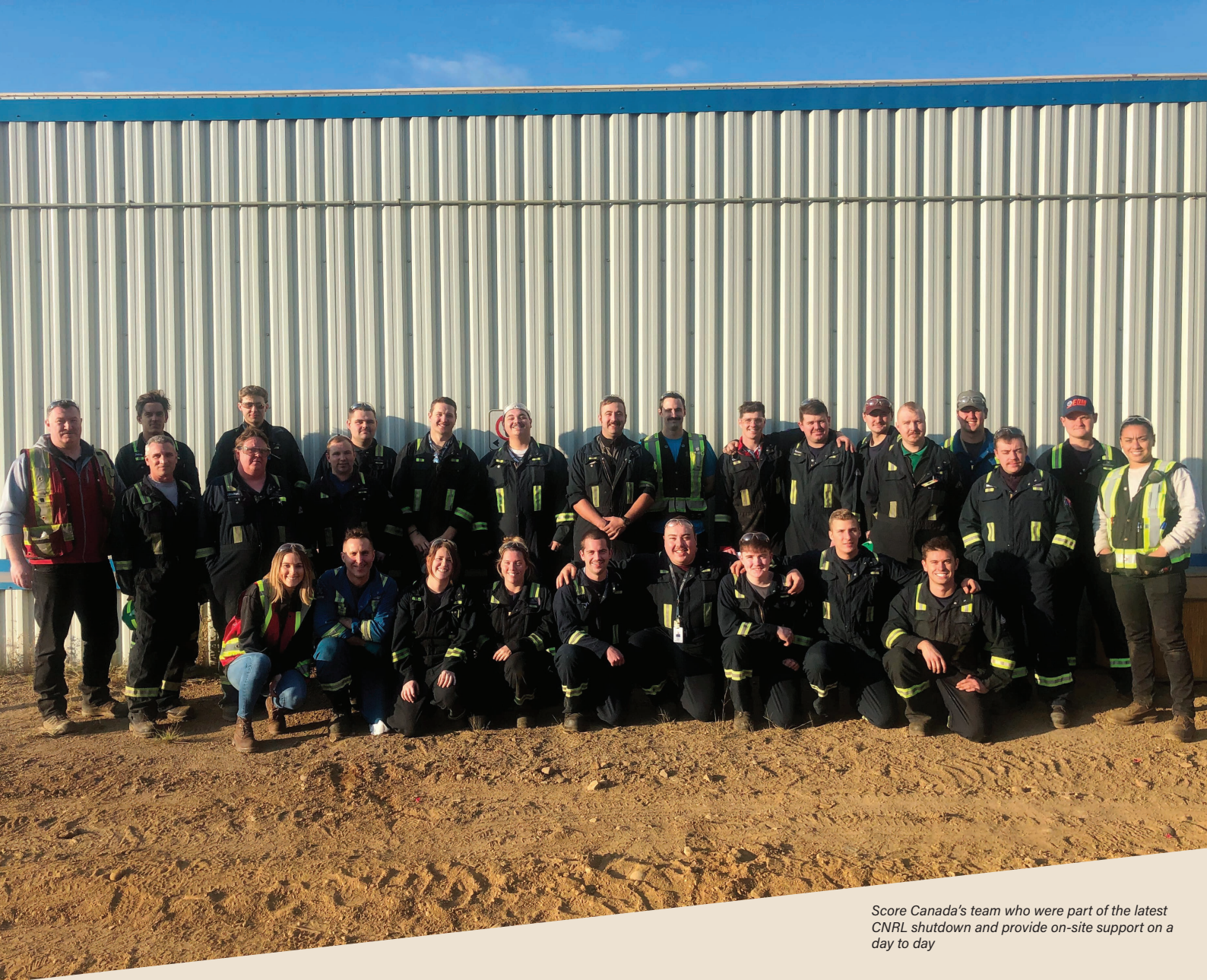
Score Canada's team who were part of the latest CNRL shutdown and provide on-site support on a day to day