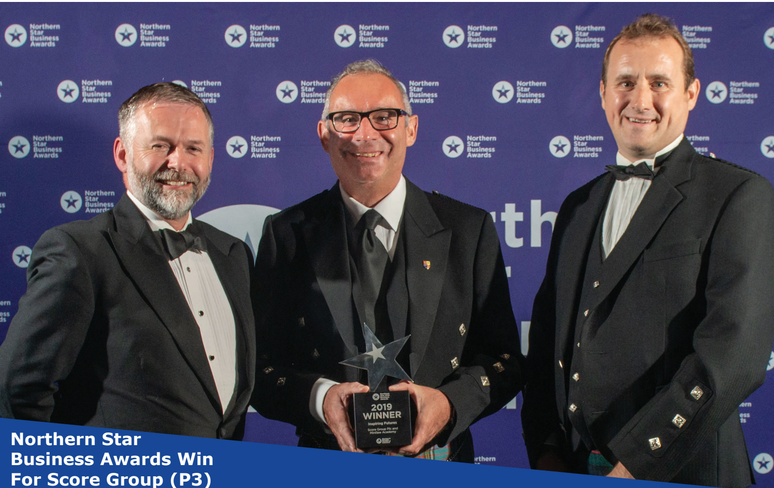
Northern Star Business Awards Win For Score Group (P3)

Score Trinidad Exports Talent Globally (P10)