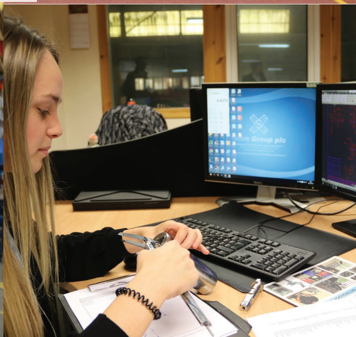
Learning new skills in the Score Europe Drawing Office in Peterhead