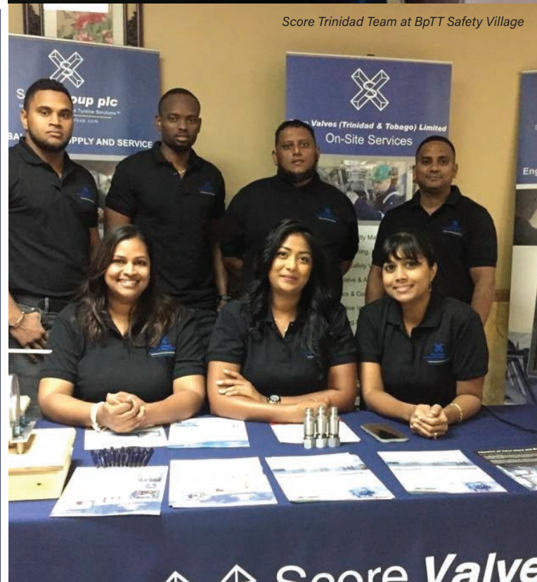
Score Trinidad Team at BpTT Safety Village

The first five valves (3 off 24" ANSI 600 and 2 off 36" ANSI 600) are scheduled to arrive in Trinidad in November 2019, and refurbishment works will commence shortly after. This prequalification represents a potential for market share for both the green and brown field projects.