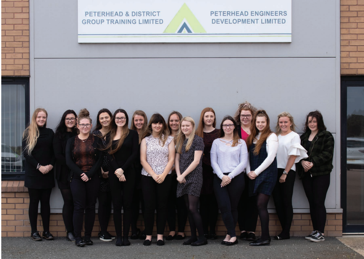
Summer intake of 2019 administration apprentices