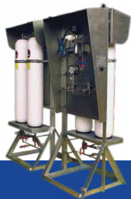
Hydraulic Control Panel (Double Acting Actuated Valve)