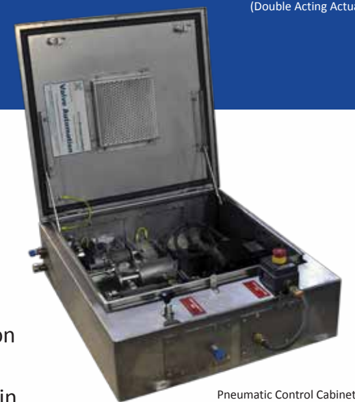
Pneumatic Control Cabinet (ESD / Partial Closure System)