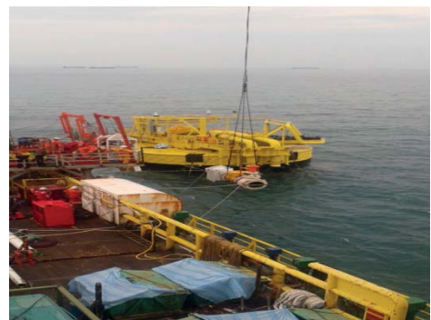
New valve in process the of being lowered into the Sea ready for fitting in to the Plem and the pipeline