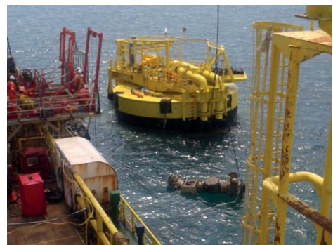
Removal of failed valves from the Seabed

For further information on services supplied by Score Subsea and Wellhead Limited visit http://subsea-wellhead.com/