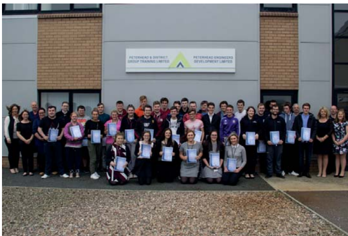
Page 6 - PEDL Annual Awards 2016