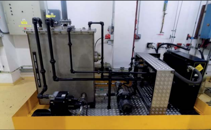
The completed lube oil skid

The test cell turbines team have recently completed a major overhaul of the lubricating oil console for the Siemens TB5000 series engine. The old console has been used for the past 10 years.