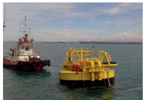
New Calm Buoy on station ready for the first Oil Tanker connection