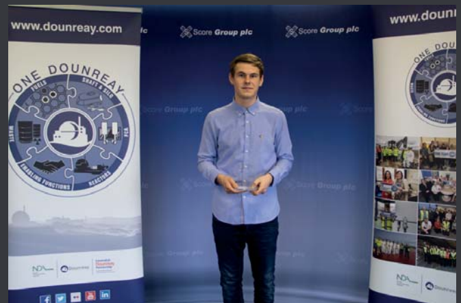
Page 5 - Craft Competition Awards 2016