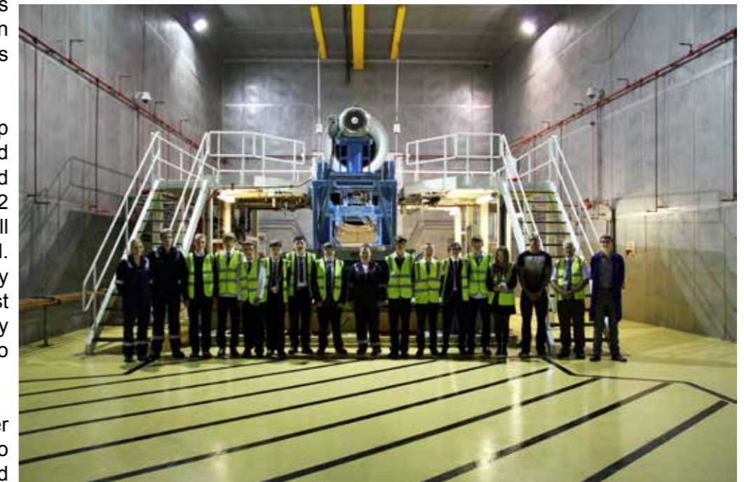
Mintlaw Academy Pupils in the Score Energy Test Cell