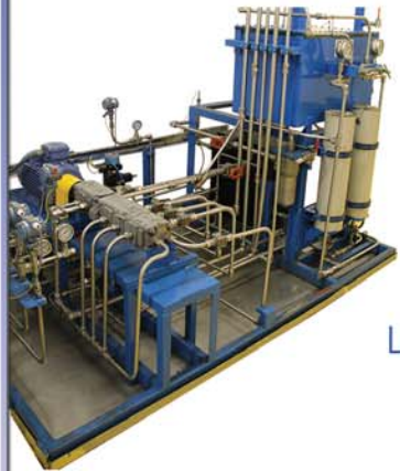
Lube Oil Consoles