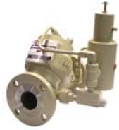
Lube Oil Pressure Control Valves