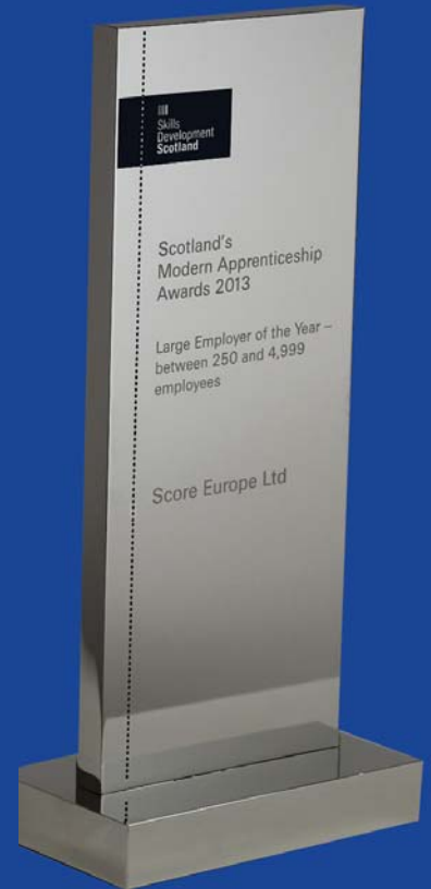
SDS Large Employer of the Year 2013

"We recognise the growth of the company is dependent on the growth of the people. Through training and guidance we assist our team member's desires to realise their potential and select their own path to achieving their personal goals and dreams"