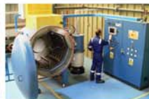
Vacuum Brazing and Heat Treatment Advanced repair schemes and manufacturing techniques.