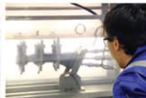
Pressure Testing External envelope and internal circuit integrity testing.