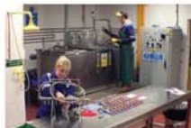
Specialised Cleaning Processes Pyrolytic and Ultrasonic cleaning cycles to remove carbon deposition.