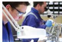
Inspection and Quality Assurance OEM trained technicians working to the latest quality standards.