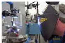
Automated Orbital Welding Rotary homogeneous TIG welding of nozzle tips.