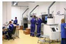
Flow and Spray Performance Testing Optimal nozzle positioning for reduced temperature deviation.